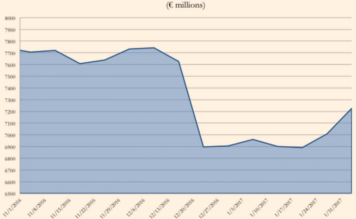
Net Notional Outstanding of CDS contracts on the Republic of France

amount of protection purchased on a credit event by the French government has grown by about €320 billion, or roughly 5 per cent: